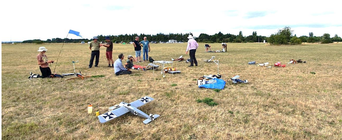
Scale Free Flight Nationals 2022 North Luffenham